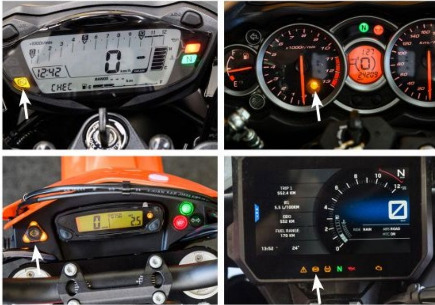
Figure 8-1-1. Examples of ABS warning light fault indication