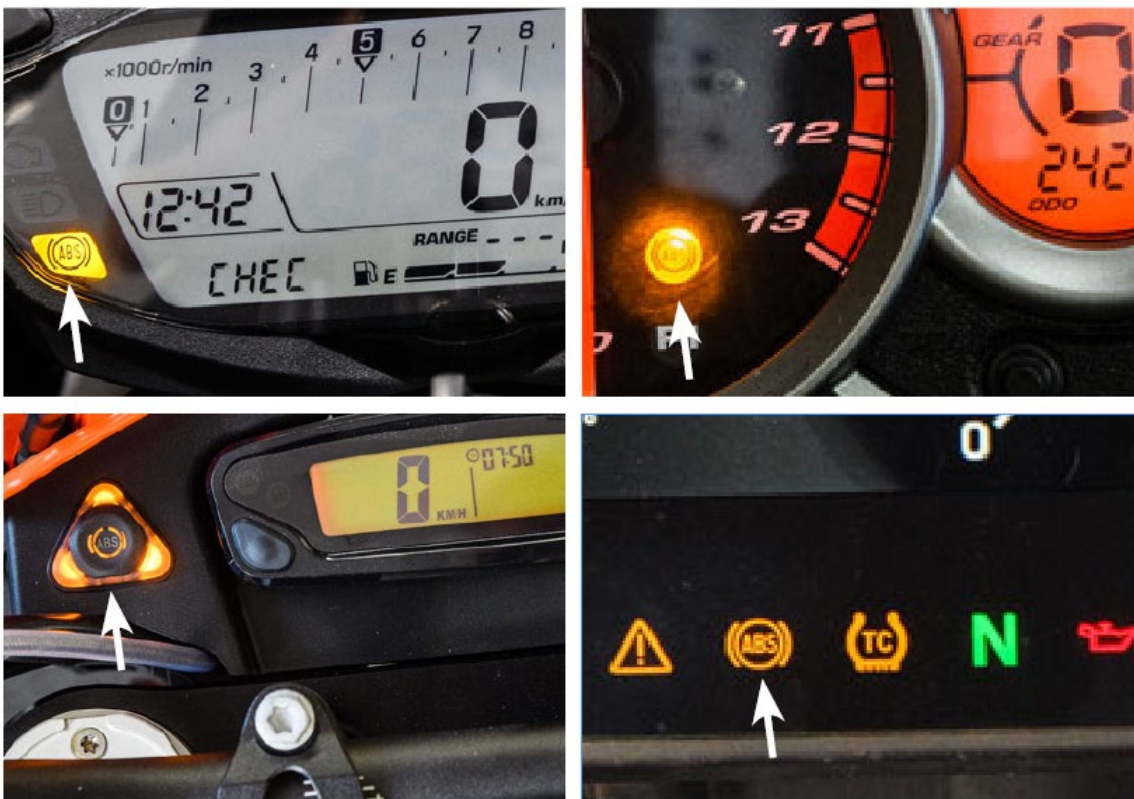
Figure 8-1-1. Examples of ABS warning light fault indication