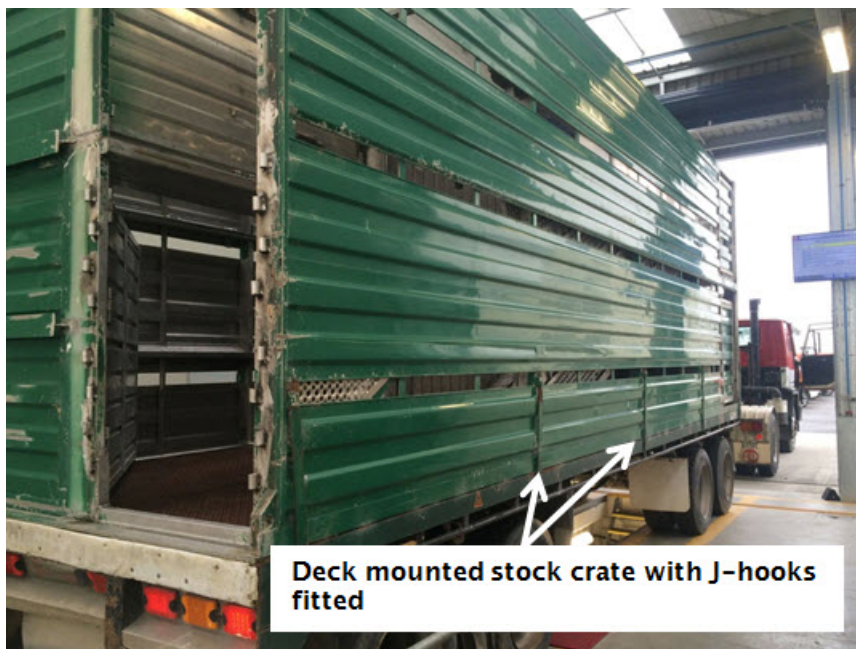
Figure 13-1-1. J-hook stock crate

The stock crate is not a vehicle therefore the actual crate J-hook mountings and J-hooks cannot be certified with an LT400 . The design can be certified with a design certificate and a plate or label attached to the stock crate.