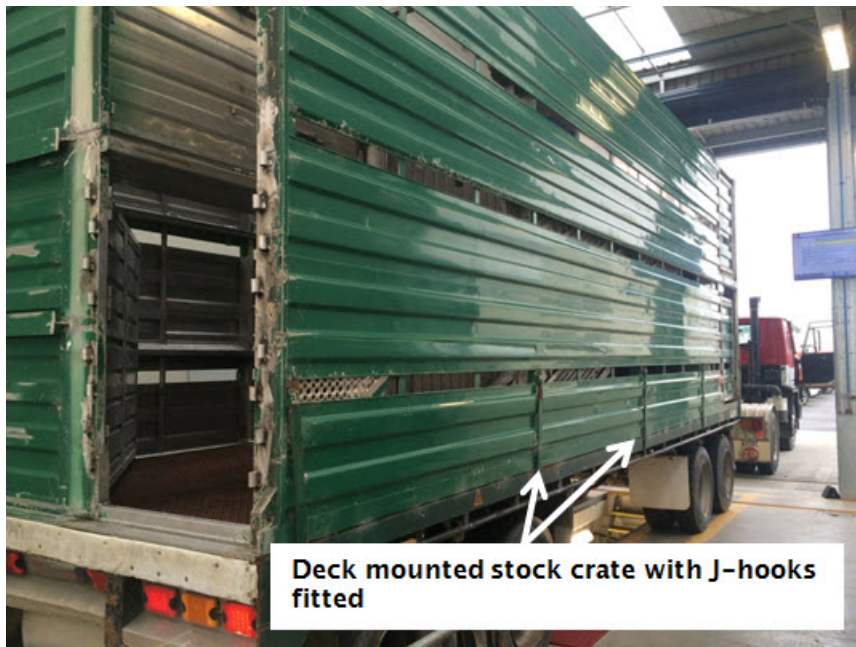
Figure 13-1-1. J-hook stock crate

The stock crate is not a vehicle therefore the actual crate J-hook mountings and J-hooks cannot be certified with an LT400 . The design can be certified with a design certificate and a plate or label attached to the stock crate.