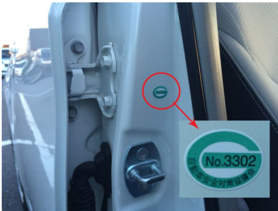
Figure 40-1-1. Airbag recall completed sticker

No visual inspection is required if there is evidence that the Takata airbag recall has already been completed on the vehicle. This can be determined by the presence of a sticker located in the driver or passenger door frame area (usually near the striker). This sticker will resemble the one in the below image, and contain the official Japanese recall campaign number. If the number on the vehicle being inspected matches one in Table 40-1-1, the recall has been completed and no visual inspection of the passenger airbag is necessary. The recall campaign numbers listed in Table 40-1-1 do not correspond to particular models, so any of the numbers listed against a make will be acceptable.